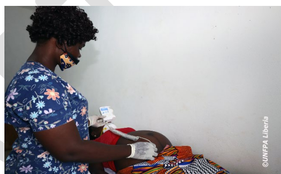
Figure 1: Midwife in service.

This programme will contribute to the achievement of universal access to sexual and reproductive health rights (SRHRs) through the three transformative goals of zero maternal death, zero unmet needs for family planning and zero gender-based violence and harmful practices. To achieve its objectives, the programme will ensure the provision of reproductive health commodities for counties of focus: Bomi, Grand Cape Mount, Gbarpolu, Maryland, Grand Kru, Rivergee, Grand Gedeh, and Montserrado counties. The country programme document (CPD) sets out to achieve the following outcomes: