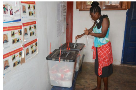
Figure 1: Woman voting in the 2017 Liberian elections.

The National Elections Commission is an autonomous public commission whose mission is to “strengthen democracy and sustainable peace by managing free, fair and transparent elections for the Liberian people”. The aim of this project is to: “strengthen the capacity of National Elections Commission and core electoral stakeholders to conduct their core activities in an impartial, transparent and sustainable manner and successfully carry out scheduled electoral processes”. The overall objective is to continue strengthening the electoral institutions and processes. As an overarching goal, this cycle should be marked by further enhanced national ownership as well as continued progress towards peaceful, credible, inclusive, and transparent electoral processes in Liberia.